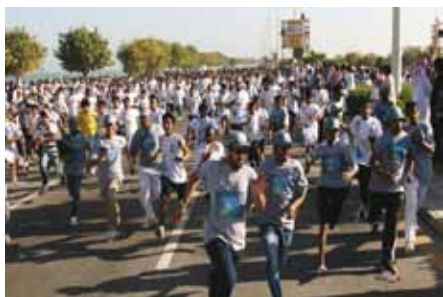
MAC (Middle East Automobile & Tourism Club.: CARE ABOUT TRAFFIC SAFETY AWARENESS